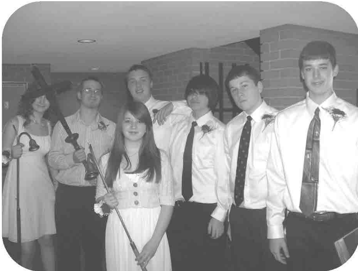
Our Gloria Dei Confirmands on Sunday, May 23.